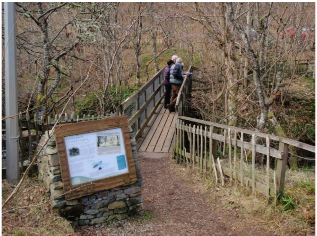
Fig. 3 – Existing bridge and interpretation (new bridge 6m away)